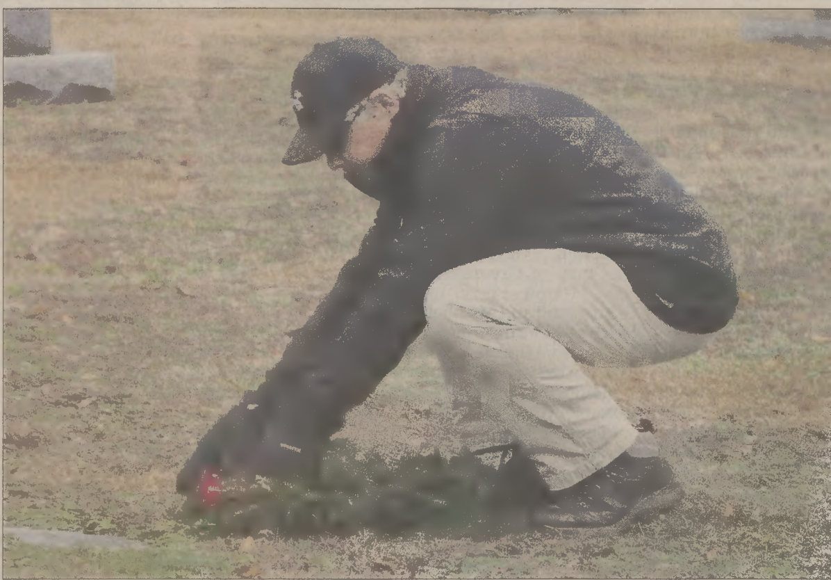
One of the participants at the Wreaths Across America ceremony places a wreath at Edgewood Cemetery.