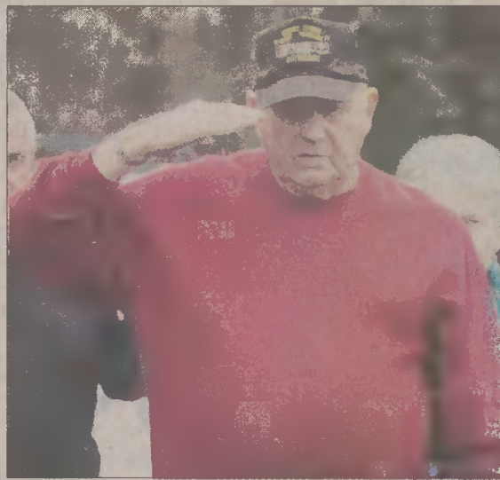
One of the many veterans attending the Wreaths Across America ceremony salutes during the presentation of colors at the event Saturday at noon.