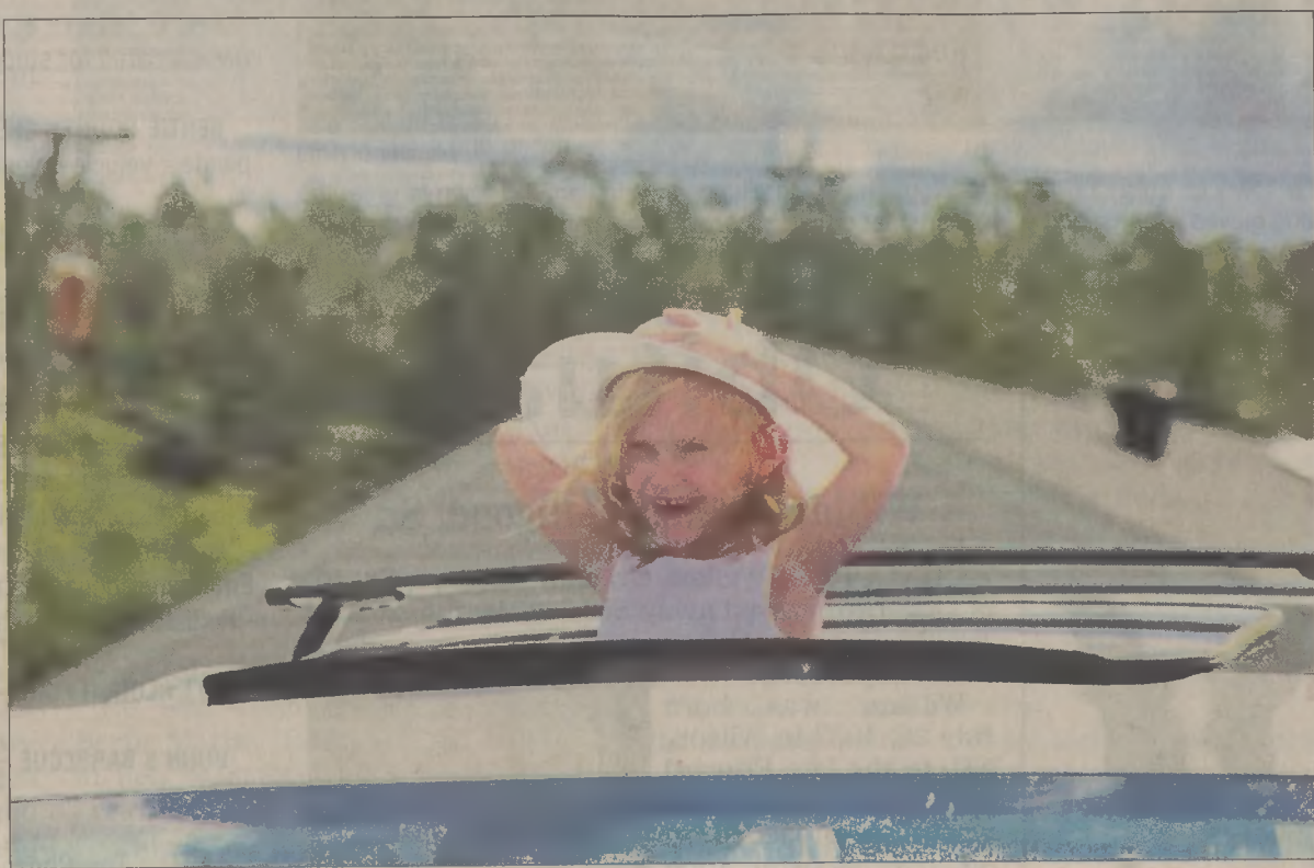
A youngster braves the wind to show off her Easter hat at Askewville Assembly of God Sunday.