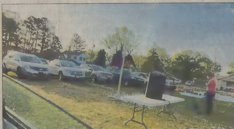
Worshippers gathered at Sandy Run Baptist Church in Roxobel for Easter service.

SCRIPTURE: Genesis 1:1-2,26 “In the beginning God created the heavens and the earth. The earth was without form, and void, and darkness was on the face of the deep.