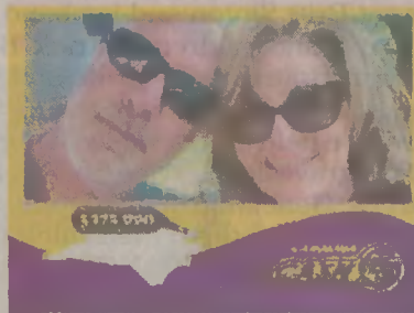
Play for its convenience.