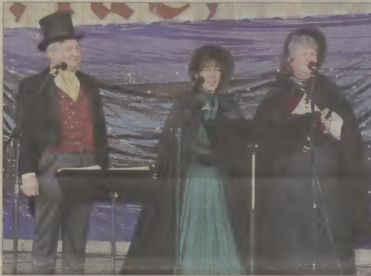
Carolers of Christmas Past performed at Saturday's Cashie Christmas Music Festival Saturday.