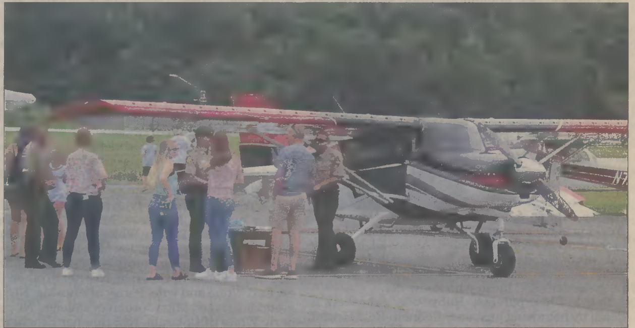
Visitors had the opportunity to meet pilots from all walks of life, including the N.C. Wildlife Resources Commission, during Saturday's open house at Tri-County Airport.