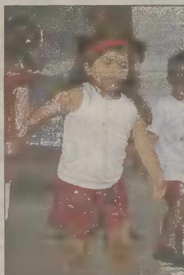
Youngsters enjoyed the opportunity to get outside and listen to music, dance, eat and watch fireworks.

“It was a fantastic evening. The weather was beautiful,” said Windsor-Bertie Cham-