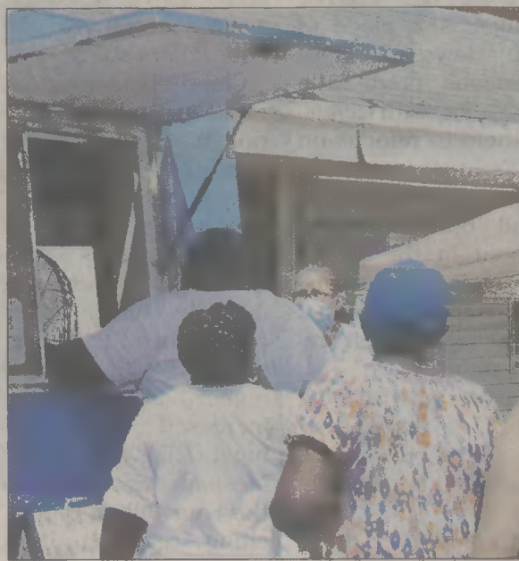
See FESTIVAL, A5 Festival-goers line up to buy food at Sunday's event.