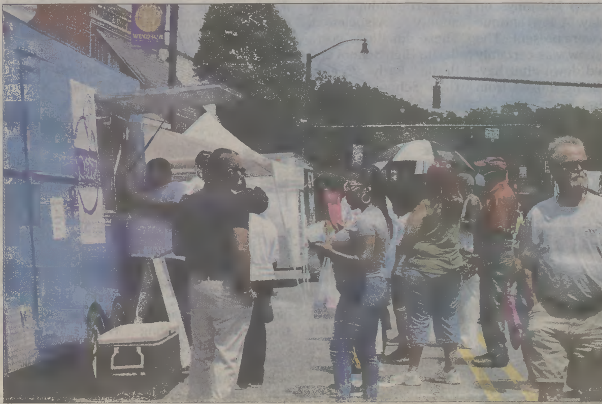
The streets of Windsor were packed with visitors due to the Bertie Alumni Community Association event.

Filing for the Lewiston Woodville seats will continue through noon on Friday.