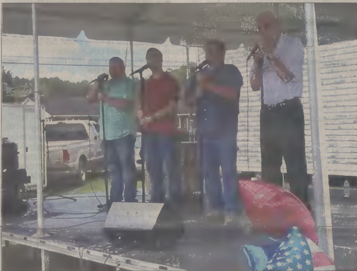
The Steadfast Quartet performed classic gospel melodies for spectators at the 2021 Askewville Fun Day.