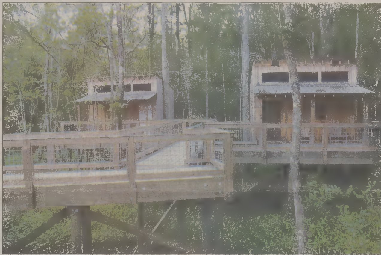
The Cashie Treehouses are a big draw for tourism in Bertie County.