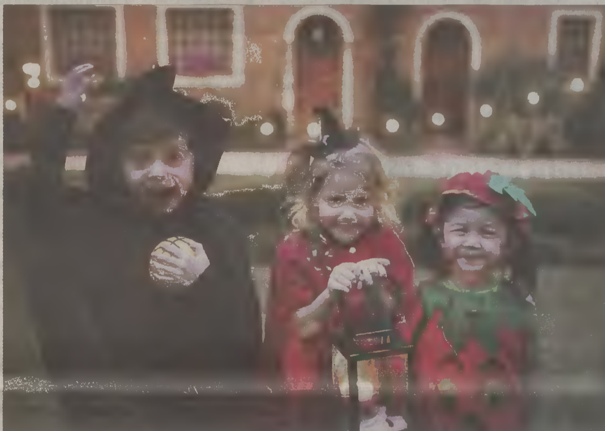
Trick-or-treating will be Saturday in Windsor and Sunday in Aulander.