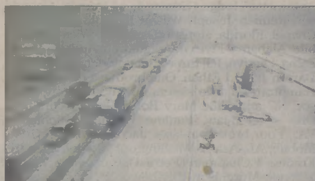
Snow on Jan. 3 shut down a section of Interstate 95 near Fredericksburg, Va. A wintry mix is possible Sunday in eastern North Carolina.