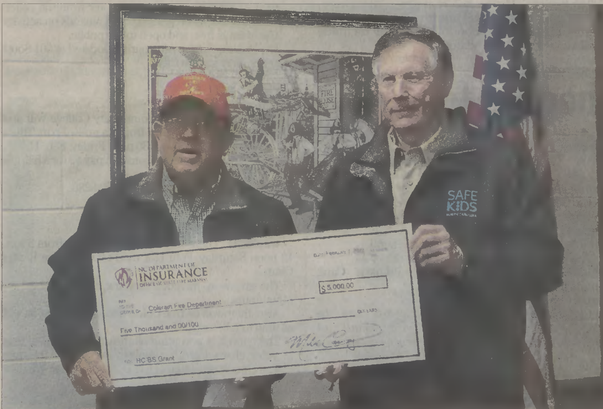
LESLIE BEACHBOARD/BERTIE LEDGER-ADVANCE

ASKEWVILLE ♦ AULANDER ♦ COLERAIN ♦ KELFORD ♦ LEWISTON WOODVILLE ♦ MERRY HILL ♦ POWELLSVILLE ♦ ROXBEL ♦ WINDSOR