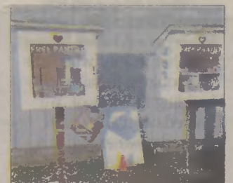
The pet pantries being built for distribution in Bertie County will be similar to these food pantries.

Two months later, Northcott is standing with a group of Bertie County residents who have formed CAAB (Companion Animal