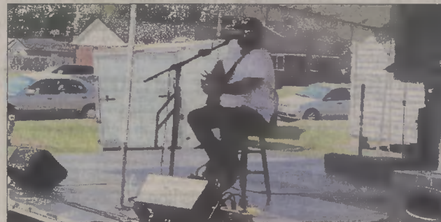
THADD WHITE/GROUP EDITOR