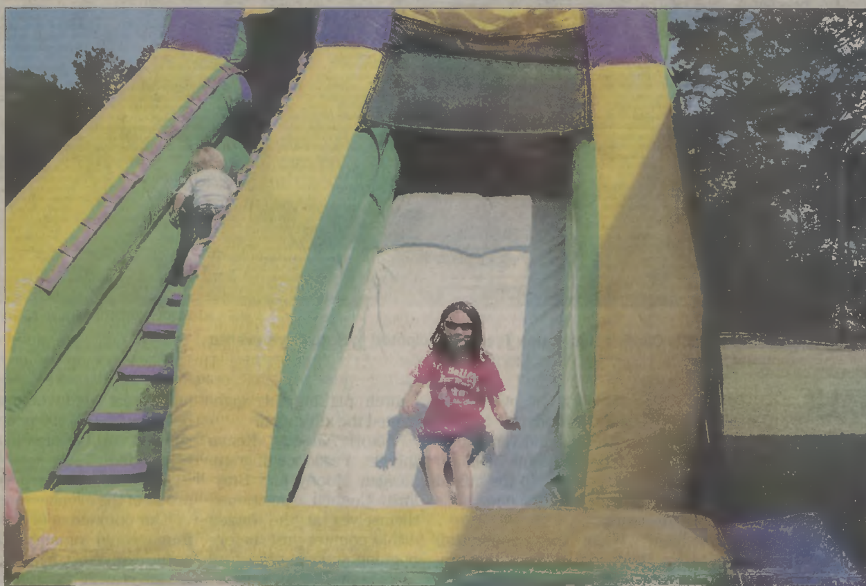
THADD WHITE/GROUP EDITOR