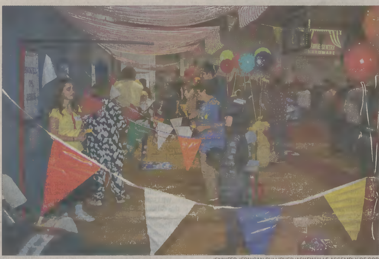
Youngsters and the young at heart gathered to play games and celebrate the Kidz Night Under the Big Top Saturday.