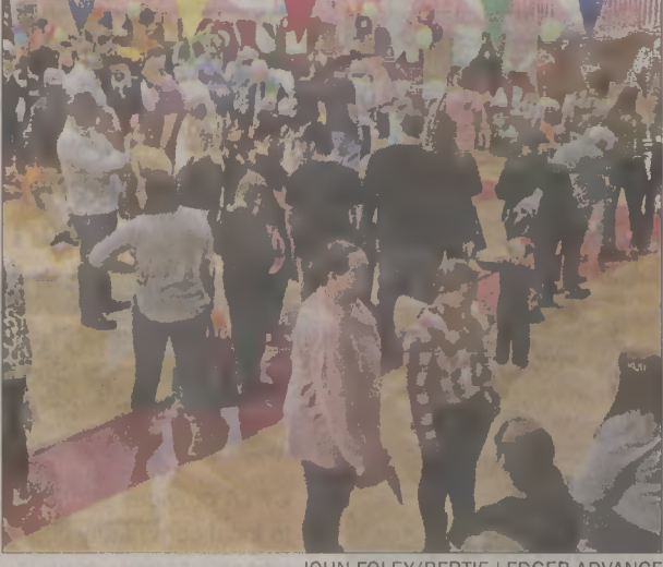
A huge crowd gathered in the gym at Askewville Assembly of God to celebrate the fall.

Whether the ring toss, ladder ball, Samsen Smash or gridiron was the game of choice, lines of exuberant, excited youngsters smiled,