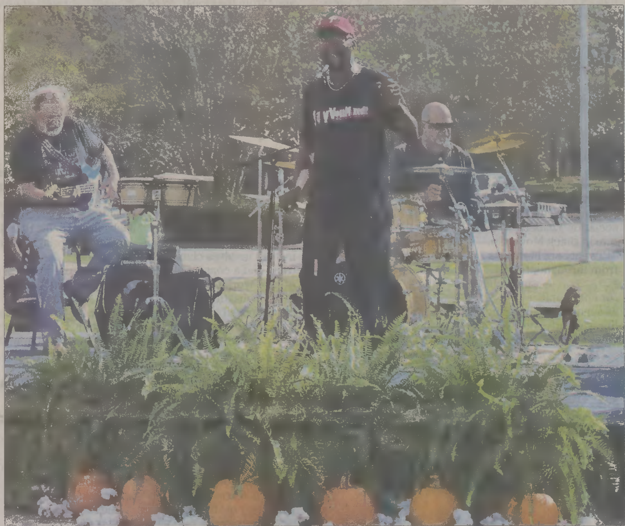
THADD WHITE/BERTIE LEDGER-ADVANCE