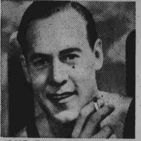
AND THEN HE SMOKED A CAMEL!

It's easy to overdo it strenuous summer sports. So remember that smoking a Camel helps to chase away fatigue and bring back your natural vigor. Enjoy Camel's "energizing effect" as often as you want. Camels never jangle the nerves!