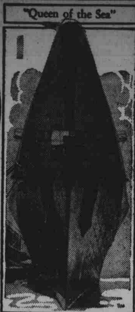
NEW YORK . . . An unusual view of the Giant Normandie, largest ship in the world, the photo being taken just before the new queen of the sea cast off for a return home after making a record breaking Atlantic crossing on her maiden crossing.

Macon county has an area of 513 square miles.