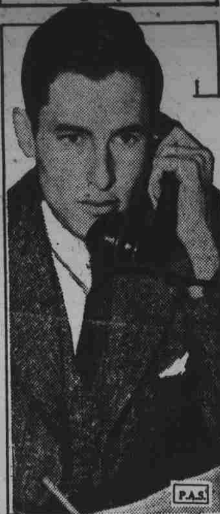
BEVERLY HILLS . . . Will Rogers Jr., (above), son of the late humorist actor, a graduate early this year from the school of journalism at Stanford University, is now part owner and editor of the Beverly Hills Citizen.