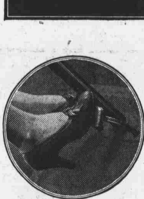
Chevrolet's Perfected Hydraulic Brakes are unbelievably soft and easy to operate—always dependable—always safe and positive in action.