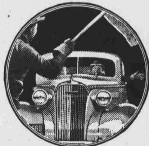
Chevrolet's composite cast-iron and steel brake drums and one-piece brake shoes with large braking surface and weatherproof sealing, are over-size—built for heavy duty and long life.

GENERAL MOTORS INSTALLMENT PLAN— MONTHLY PAYMENTS TO SUIT YOUR PURSE