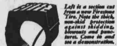
Left is a section cut from a new Firestone Tire. Note the thick, non-skid protection against skidding, blowouts and punctures. Come in and see a demonstration.

More than 40,000 of these deaths and injuries were caused directly by punctures, blowouts and skidding due to smooth, worn, unsafe tires!