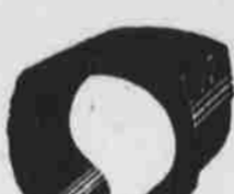
Left is a section cut from a smooth, worn tire, with non-skid protection worn off. Tires in this condition are liable to punctures, blowouts and skidding.

JOIN THE FIRESTONE Save a Life CAMPAIGN TODAY!