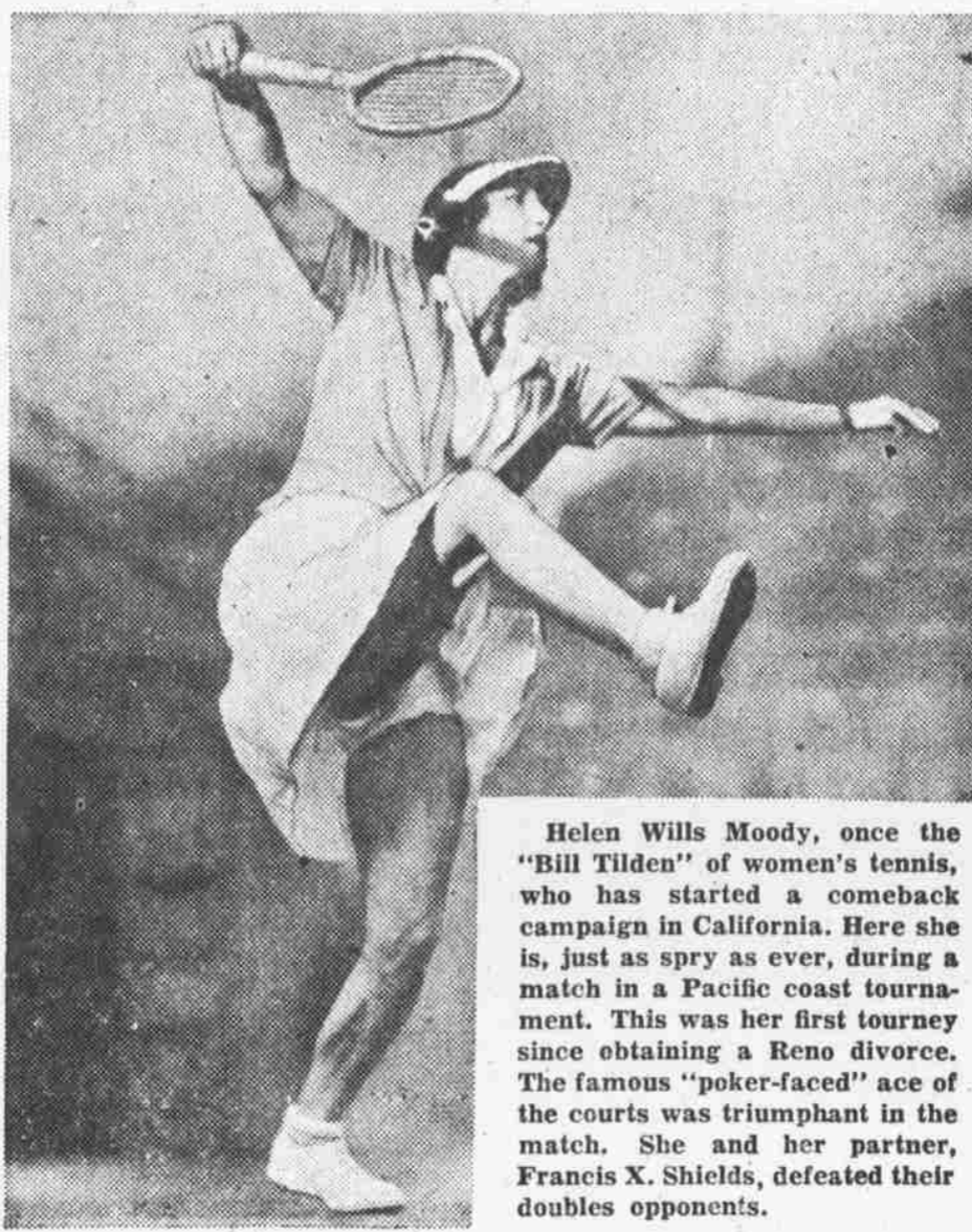
Helen Wills Moody, once the "Bill Tilden" of women's tennis, who has started a comeback campaign in California. Here she is, just as spry as ever, during a match in a Pacific coast tournament. This was her first tourney since obtaining a Reno divorce. The famous "poker-faced" ace of the courts was triumphant in the match. She and her partner, Francis X. Shields, defeated their doubles opponents.