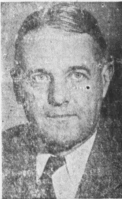
Col. William J. Donovan, Republican candidate for governor of New York in 1932, who is directing the battery of 46 defense lawyers for the oil companies, newspapers and trade papers on trial in the federal court at Madison, Wis.