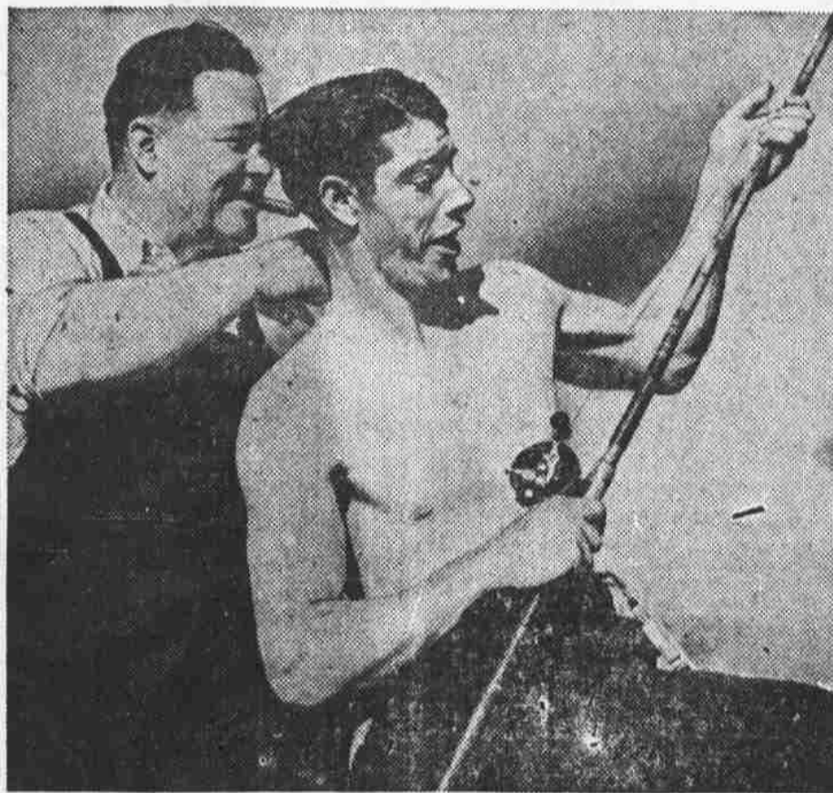
Joe Di Maggio, sensational outfielder of the New York Yankees, now living with his family in San Francisco for the winter, is shown as he fished for striped bass in San Pablo bay. While admiring onlookers rooted for him the home-run king brought in several fish.