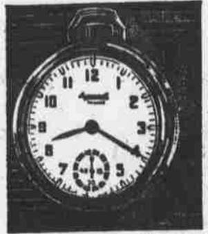
YANKEE — $1.50

You can buy them at stores right here in town.