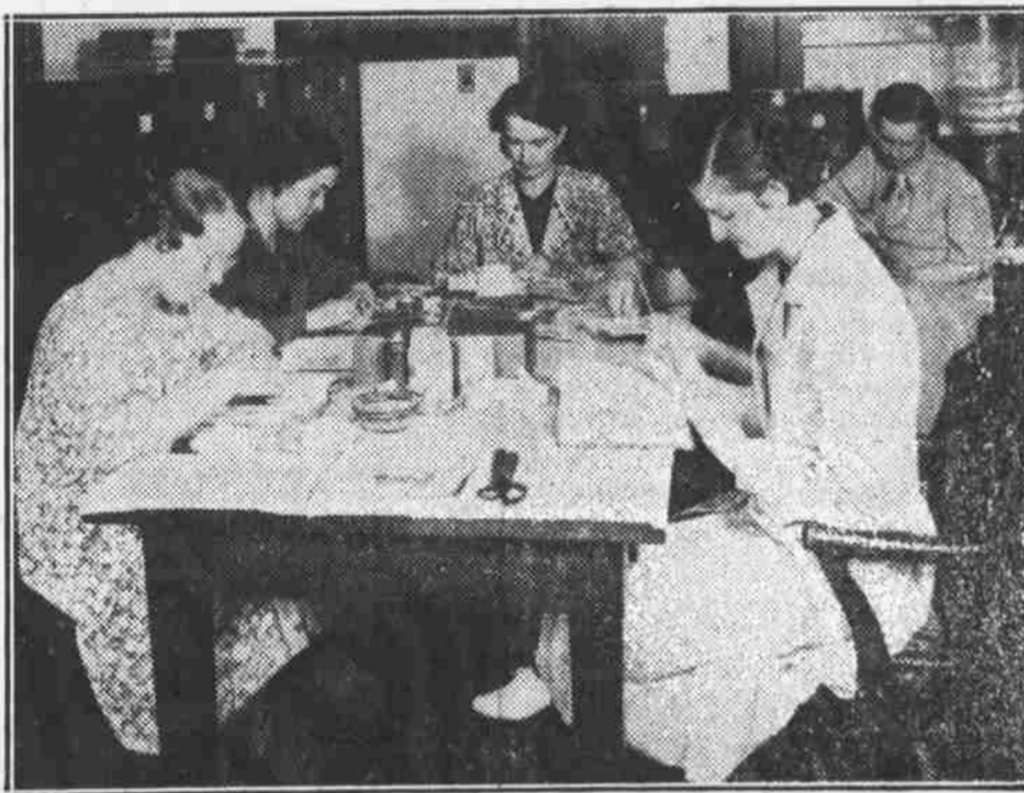
Bookmending Unit in Operation