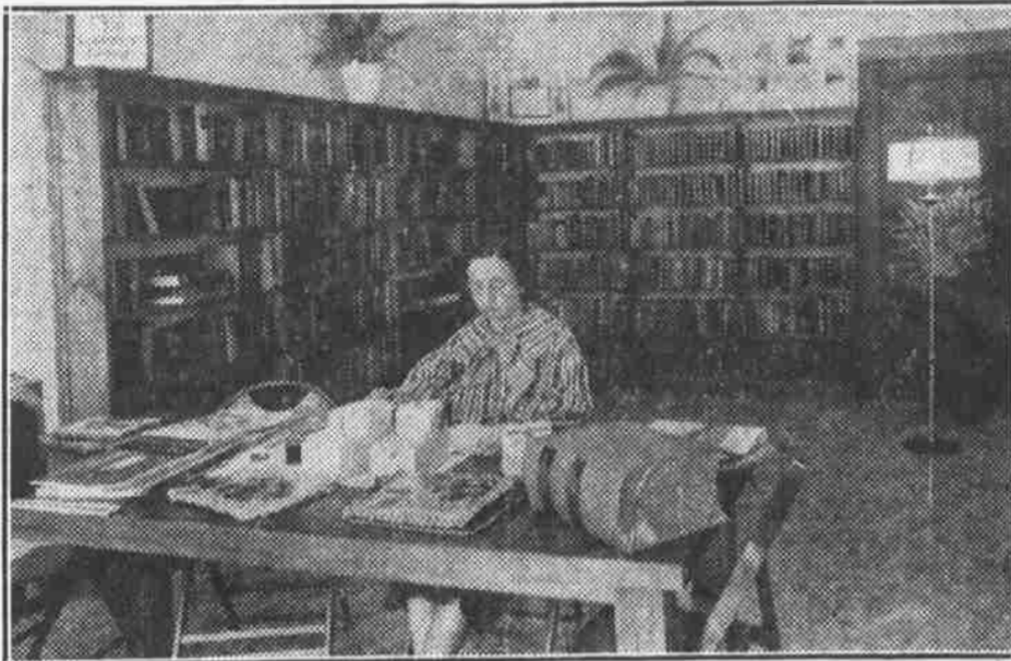
Corner of a County Library