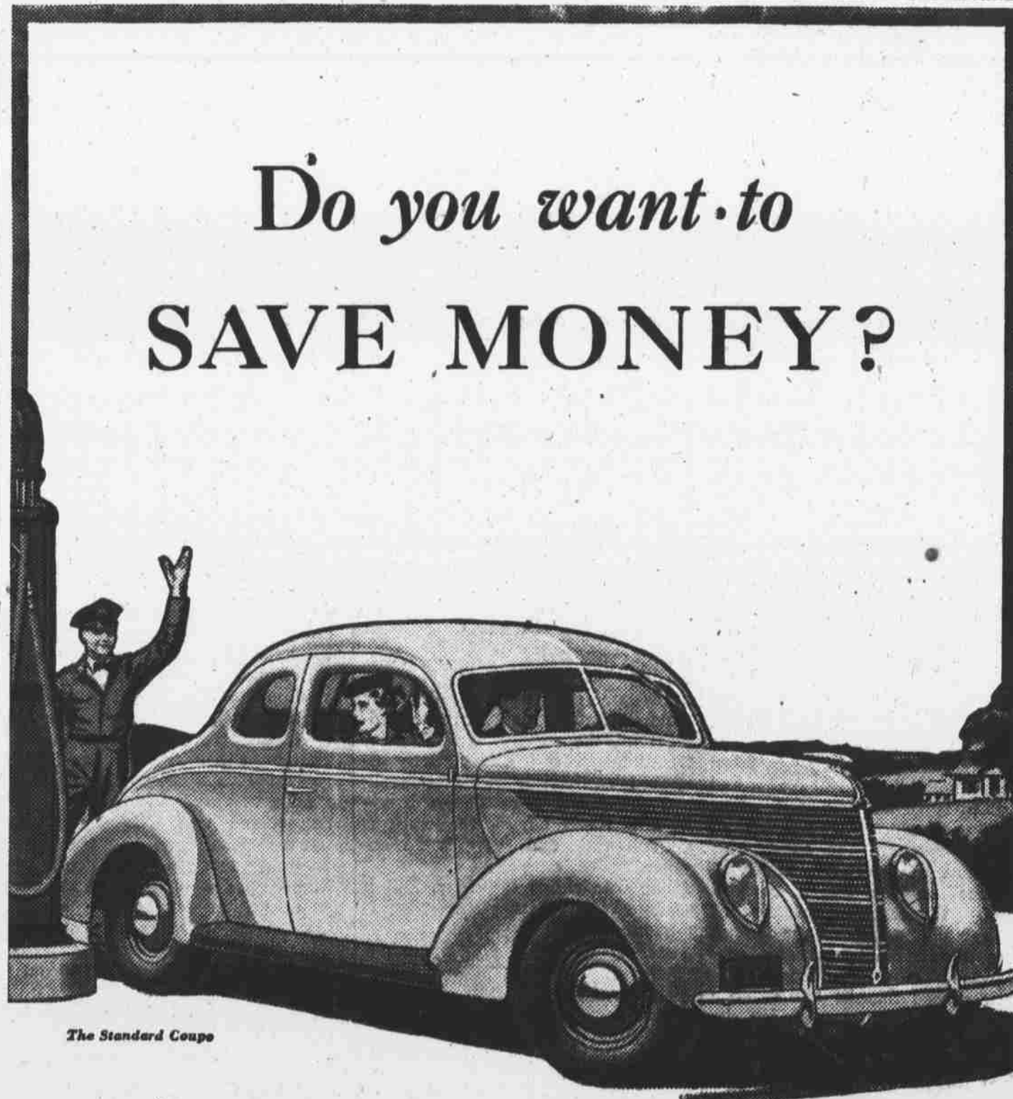
The Standard Coupe

The members and friends of Iotla Methodist church will meet to clean off the grounds of the cemetery on Thursday, April 21. It will be an all-day affair, and all interested are urged to attend.