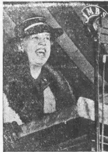
Mrs. Franklin D. Roosevelt, who was guest of honor at the dedication and ground breaking for the Federal building for the 1939 Golden Gate International exposition in San Francisco. Here she is shown delivering her address, after which she rode in a flower bedecked tractor to break the ground.