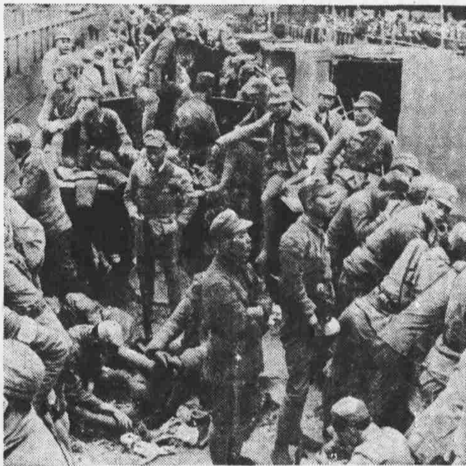
On the Lunghai line going to the front line battlefield, Chinese troops are shown at the railroad station about to entrain. The stubborn resistance of the Chinese troops to the Japanese invasion is regarded as one of the military miracles of modern times.