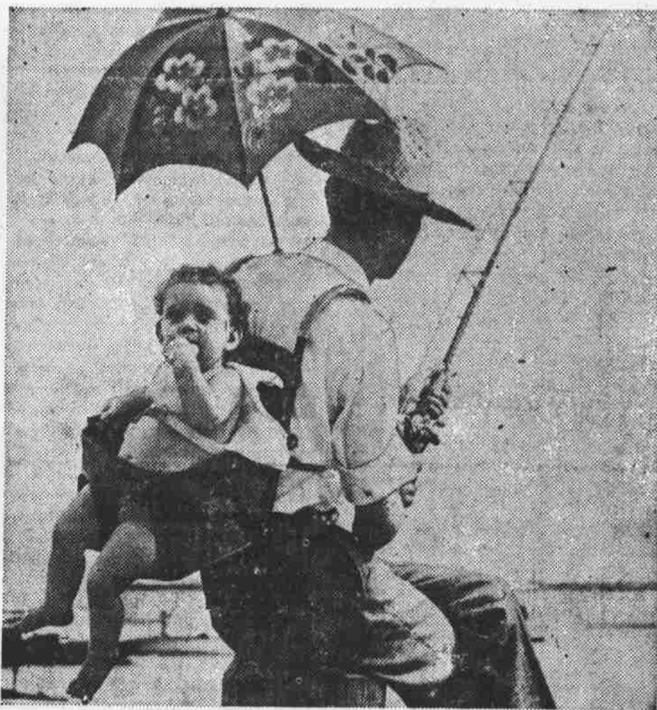
The wife was away visiting. So faced with the problem of what to do with the baby, this fisherman rigged up a seat and sunshade for her while he calmly fishes from the pier at Miami, Fla.