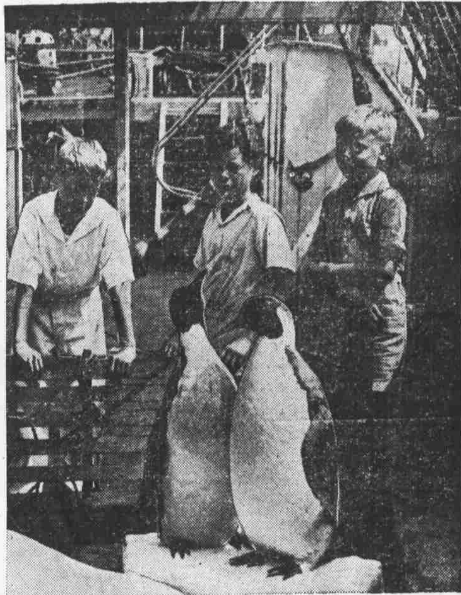
The saucy and playful birds pictured above are members of the flock of penguins from the Byrd's South Pole expedition, coming to Franklin for one day only, Wednesday, August 17. The amusing avians are shown in conjunction with over 100 deep sea terrors, featured with the Mammoth Marine Hippodrome. The exhibit will be located near the courthouse and will be open to the public from noon until 11 p. m. Admissions ten cents.