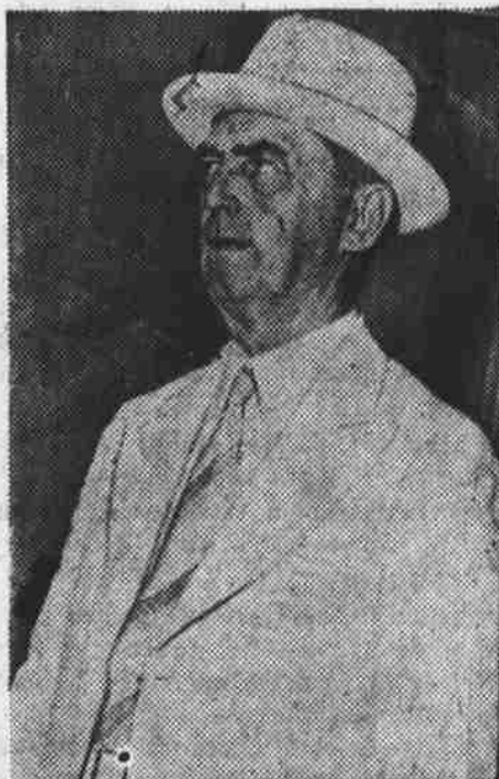
Adm. William D. Leahy, chief of naval operations, leaves the White House after conferring with President Roosevelt on next year's naval building program. Admiral Leahy said it would probably be necessary to increase the budget over its present level by $200,000,000 because building costs would increase as work advanced on ships now under construction.