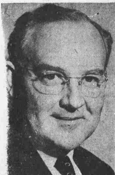
Judge Fletcher Bowron is Los Angeles' new mayor, the winner in a recall mayoralty election. Mayor Frank L. Shaw was recalled as Bowron was elected over him by a majority of more than 100,000.