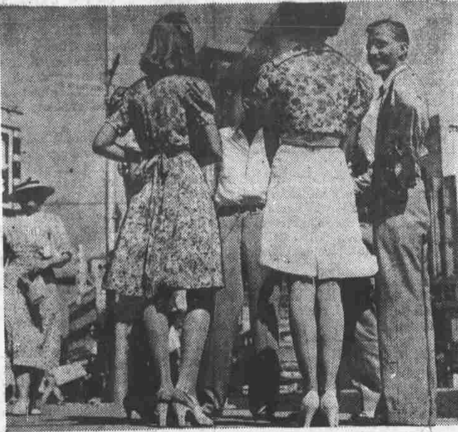
Fashion experts' predictions that the knee-length skirts of the flapper era are on their way back appear a little late. They have already arrived, judging from this Miami street scene.