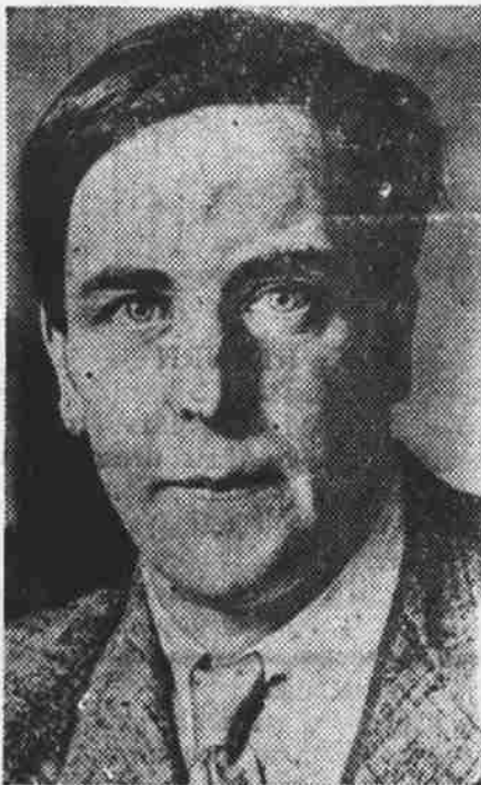
Professor Peter Kapitza, retained by the Soviet government, has perfected a new method of liquefying gases, only a few details of which are known. His discovery will have great scientific and industrial importance.