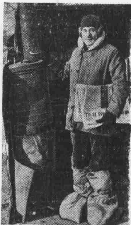
A sudden midwest cold wave didn't catch this newsboy unprepared. He foiled the wintry blasts with a makeshift stove and a couple of gunny sacks. He also added a couple of sweaters to his ensemble.