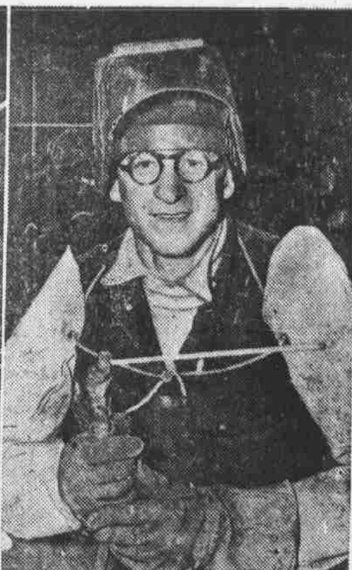
The America, largest ship to be built in this country, is now under construction at the Newport News Shipbuilding company in Virginia. The new super vessel will be the running mate for the Manhattan and Washington in the transatlantic fleet. Pictured at the left are highly skilled mechanics blading the low pressure turbines, a part of the America's driving machinery. There are some 15,000 of the blades for the casing plus that many for the rotor. At the right is a well-outfitted electric welder, dressed in safety equipment.