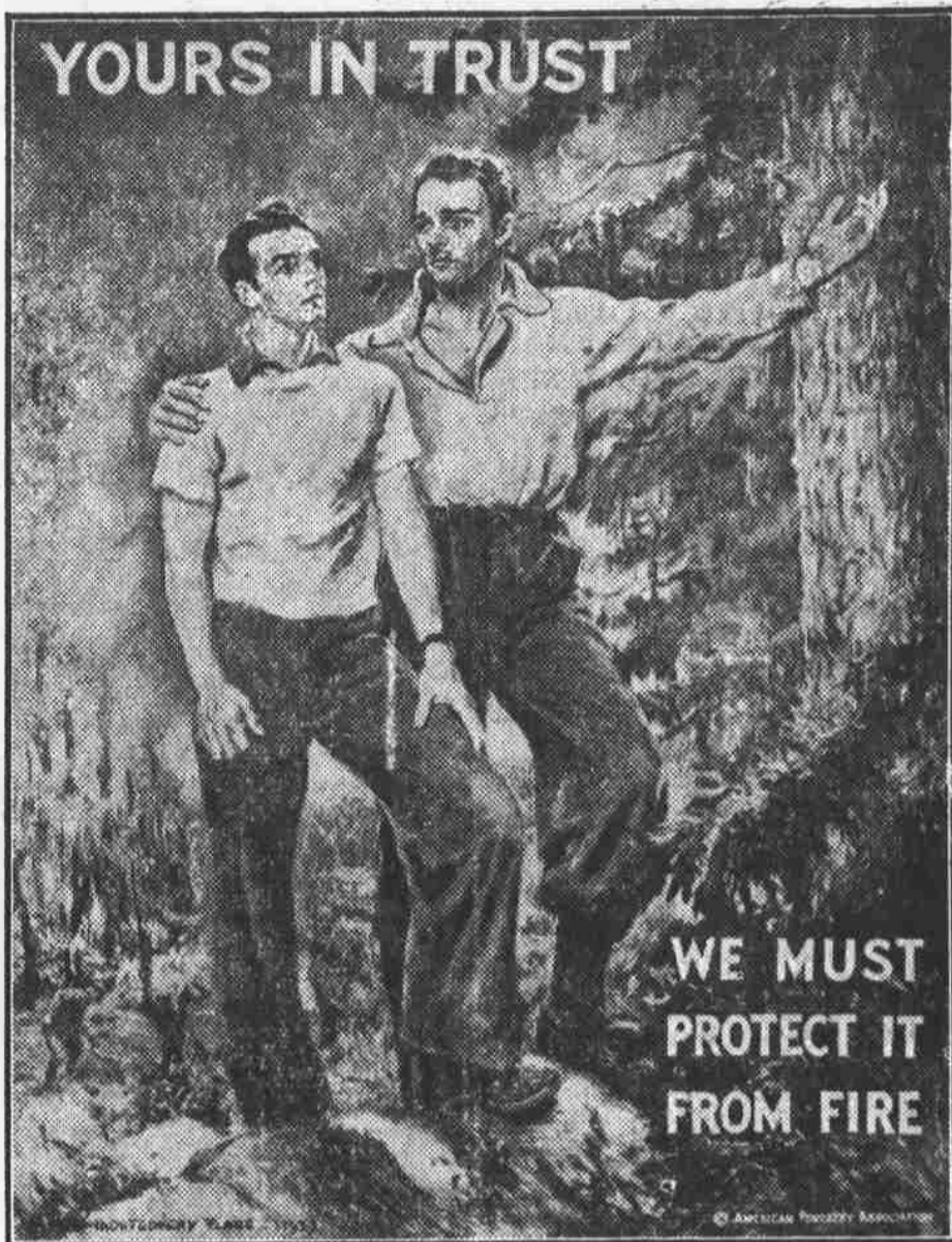
In the perpetual campaign to stamp out man-caused fires that burn over 40,000,000 acres annually, the United States Forest Service in co-operation with the state forestry agencies and organizations interested in conservation, will distribute in poster form nearly a million reproductions of the above painting by the famed illustrator, James Montgomery Flagg. The painting is the property of the American Forestry Association.

SERVICE STATION Washing — Polishing Expert Lubrication Phone 1904 Franklin, N. C.