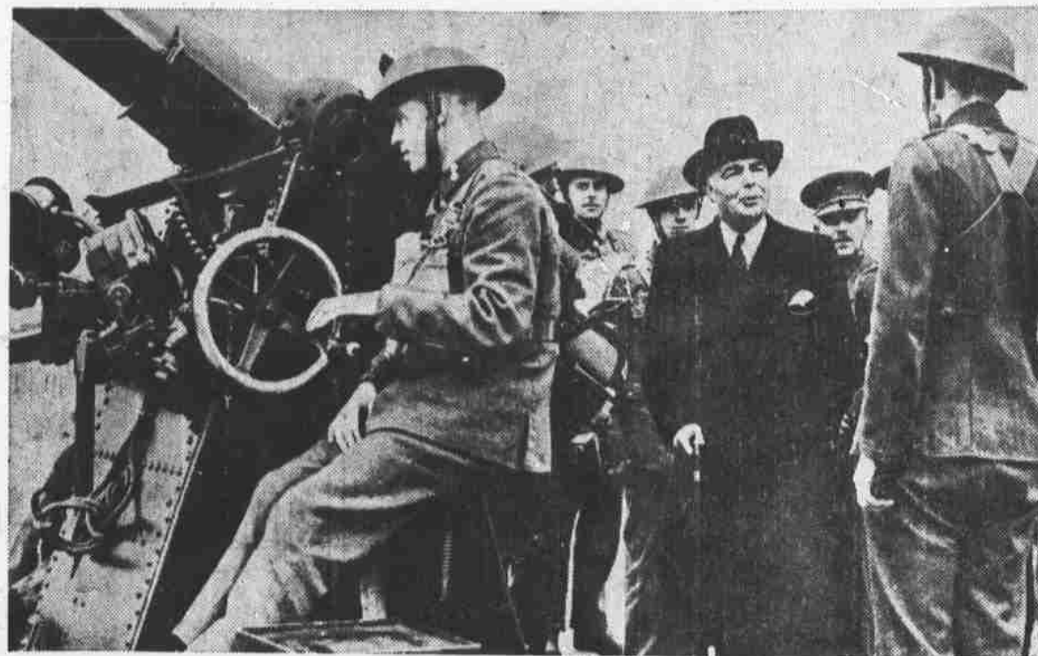
Leslie Hore-Belisha, British minister of war, is shown during his inspection of a South London anti-aircraft station recently as he made the rounds of several of the "war stations" and anti-aircraft units in and around the city. The stations are manned by members of Britain's territorial army who are undergoing their annual training.