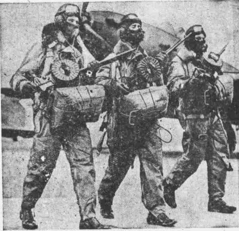
Bound for an observation flight over enemy territory, these three British musketeers of the air head for their bombing plane. Equipment includes oxygen masks, telephone apparatus, parachutes and machine guns. In addition to the gunners, the plane carries a pilot, co-pilot and photographer.