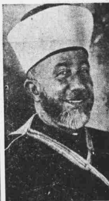
Fears that Ham Amin El Husseini, former grand mufti of Jerusalem who recently escaped from exile, may start a new anti-British terrorist campaign were expressed by government officials. The mufti, now in Iraq, is held responsible for the Arabs' campaign of terrorism.