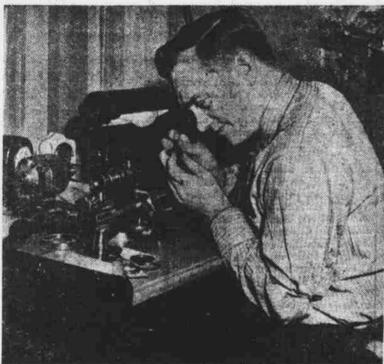
Warren K. Billings, who served 23 years of a life sentence in Folsom prison in connection with the San Francisco Preparedness day bombing in 1916, is now running his own watch-repairing shop in San Francisco. Billings learned the profession in prison, where he says he worked on 10,000 watches owned by fellow prisoners and prison officials. Billings is pictured at his work bench, surrounded by tools presented him by friends, many of whom worked diligently to secure his release from Folsom. Tom Mooney, convicted with Billings, was released from San Quentin after serving 22 years.