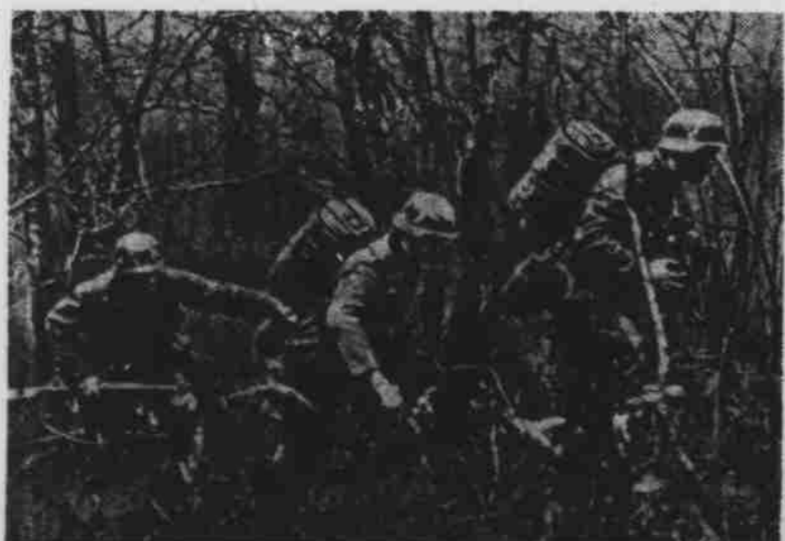
Steel-hatted German soldiers, serving as waiters, make their cautious way through the woods near the front line "somewhere in Germany" carrying rations for the garrison of an advanced outpost. The man in the rear is a guard, whose duty it is to protect the food. There is probably hot soup or stew in the tureens on the back of the "waiters."