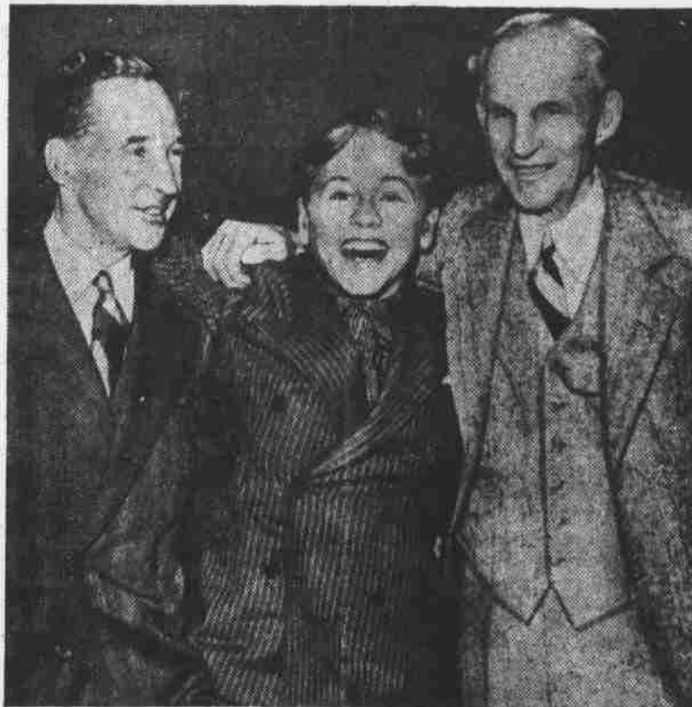
Mickey Rooney, young movie star, in a friendly pose with motor car magnates Edsel (left) and Henry Ford. Mickey is a guest of the Fords while in Detroit, Mich., for a movie premiere. The new film, shown for the first time in the motor city, was the life story of Thomas Edison. Henry Ford's enthusiasm perhaps is the result of his life-long admiration for the inventive genius of Edison.