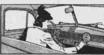
STYLE THAT'S OUTSTANDING