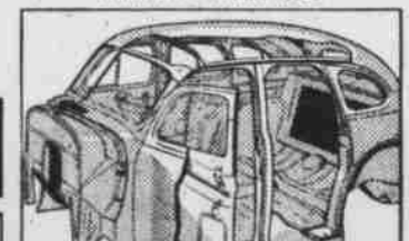
ULTRA-SAFE UNISTEEL CONSTRUCTION