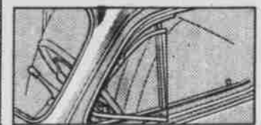
ORIGINAL NO DRAFT VENTILATION

AGAIN CHEVROLET'S THE LEADER Eye It...Try It...Buy It!