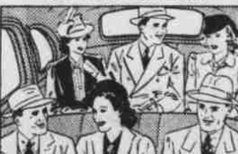
"3-COUPLE ROOMINESS" IN SEDANS