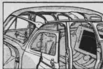
SOLID STEEL TURRET TOP