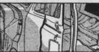
DOUBLE-PANELED STEEL DOORS