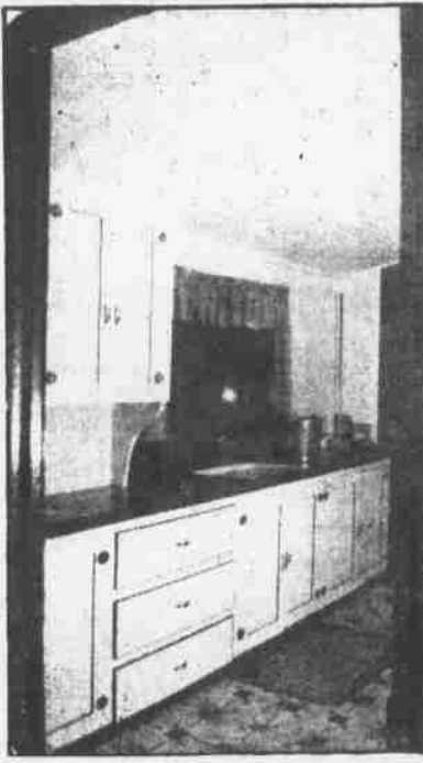
Of a Home Demonstration Club Member.