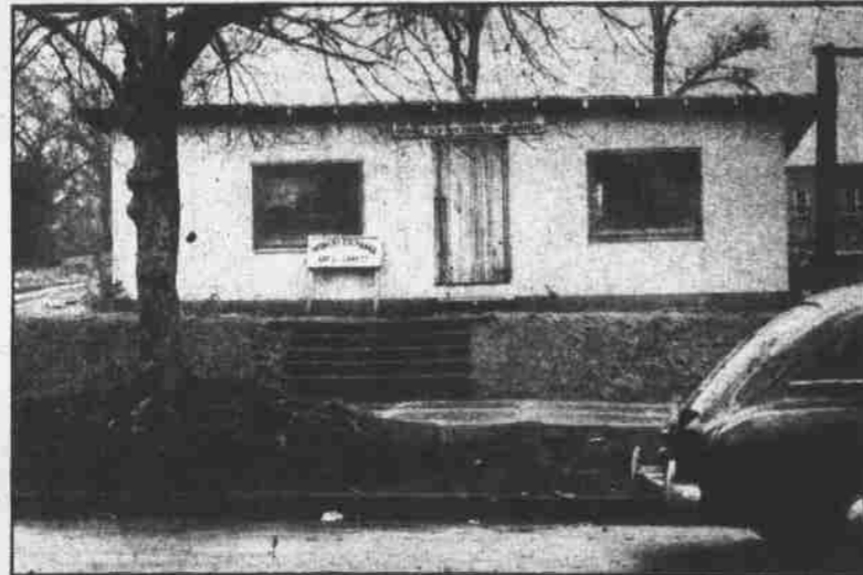
Curb Market on Main Street. Built and conducted by Home Demonstration Club women of Macon County.