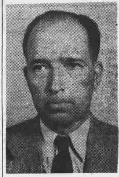
the Macon County Welfare Board.