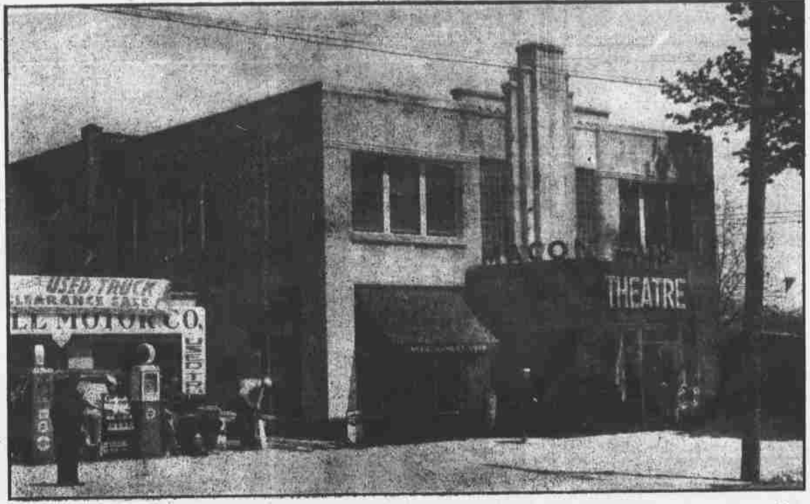
Macon Theatre was built two years ago by W. C. Burrell and leased to the Rabun Amusement Co. This $35,000 modern theatre, with 575 seating capacity, is an example of the owner's faith in the future of Franklin.