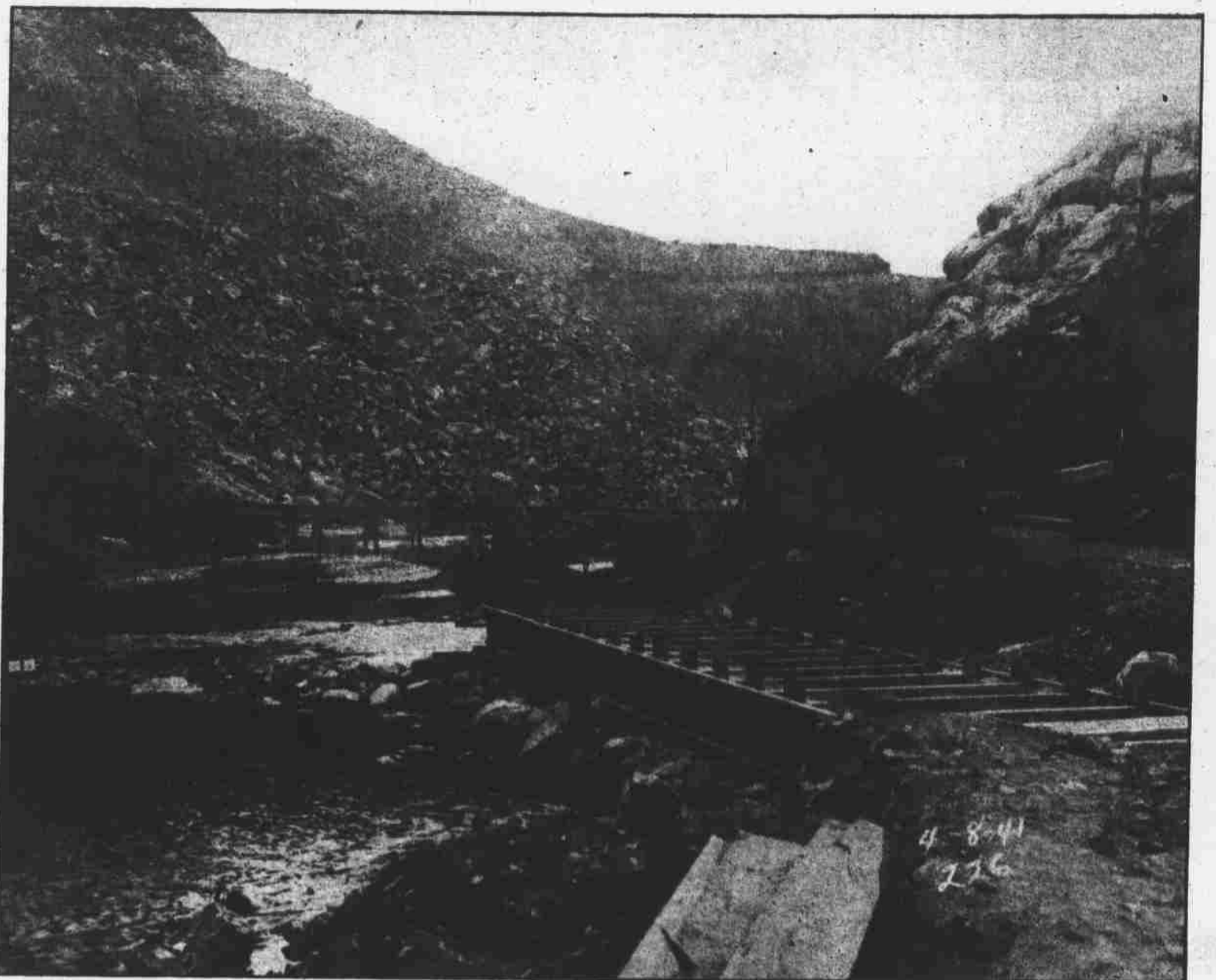
This view, looking from the down-stream side of the dam shows a portion of the rock fill that will go into the dam. The small building in the foreground contains large electric drive pumps which are used to sluice down the abutments and pack down the material being put into the dam.