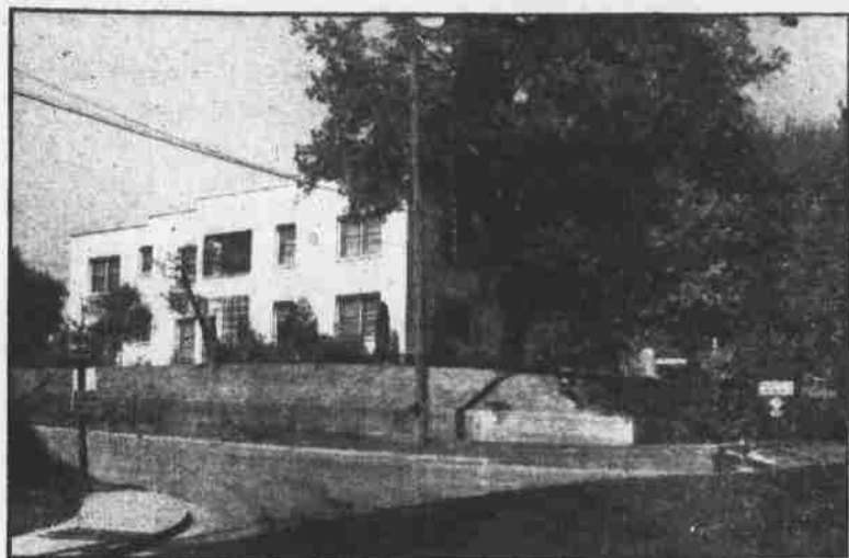
Carolina Apartments, corner of Main Street and Harrison Avenue