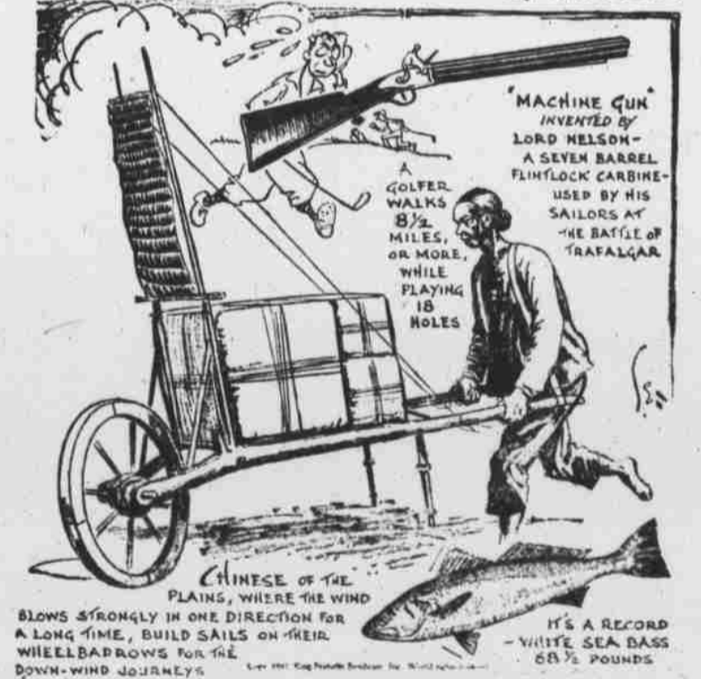
CHINESE OF THE PLAINS, WHERE THE WIND BLOWS STRONGLY IN ONE DIRECTION FOR A LONG TIME, BUILD SAILS ON THEIR WHEELBARROWS FOR THE DOWN-WIND JOURNALS.