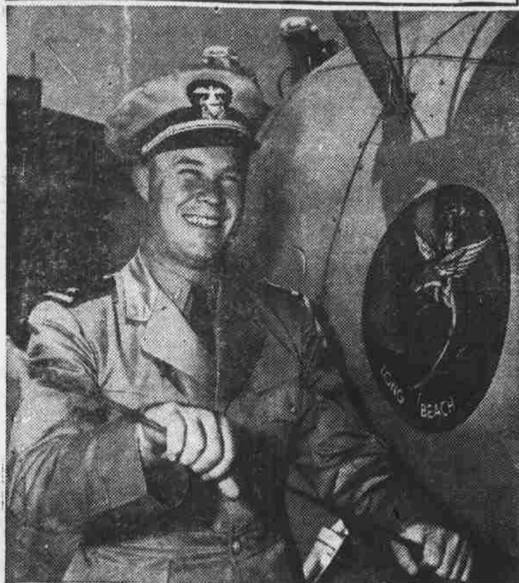
Ensign Wayne Morris Seeks Wings

Wayne Morris, recent star of "I Wanted Wings," became a member of Uncle Sam's Navy in May 1941, when he was appointed to the rank of Ensign.