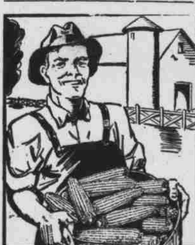
GROWERS of CORN HAVE FOUND ARMOUR'S PAYS and PAYS

WED.-THURS., APRIL 15-16: BUD ABBOTT LOU COSTELLO IN "Keep 'Em Flying" With: MARTHA RAYE