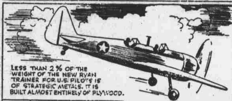
LESS THAN 2% OF THE WEIGHT OF THE NEW RYAN TRAINER FOR U.S. PILOTS IS OF STRATEGIC METALS. IT IS BUILT ALMOST ENTIRELY OF PLYWOOD.